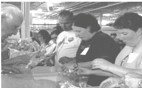
Working at Matthew 25

P.S. We can all be thankful when we can apply God's word with zest.